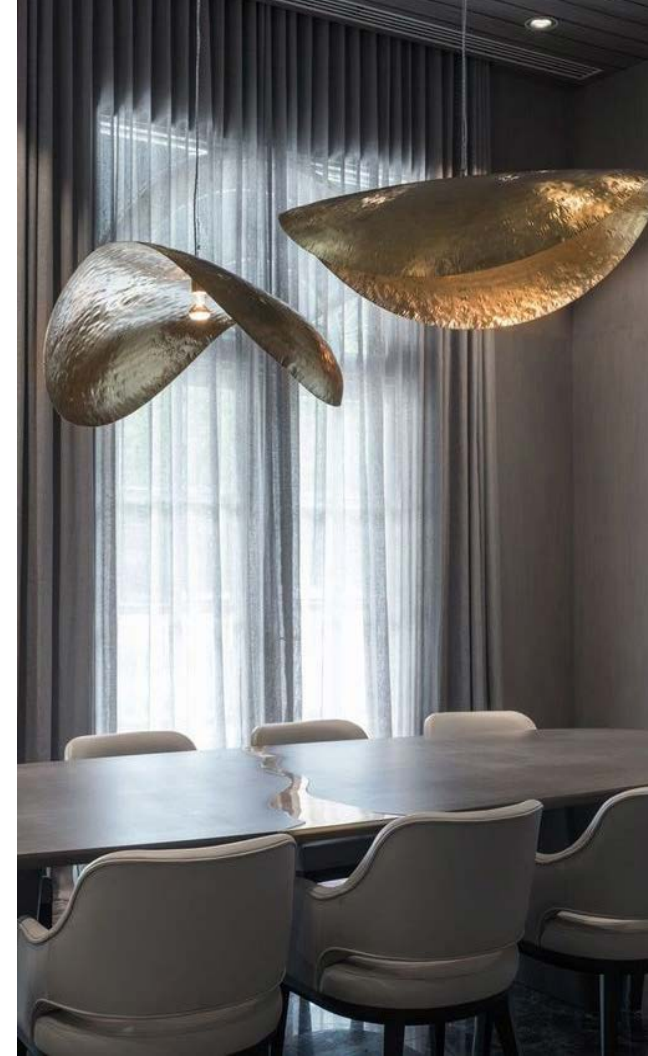
Install a cluster of metal pendants within each soffit in varying shapes creating the silhouette of a flock of birds in migration.