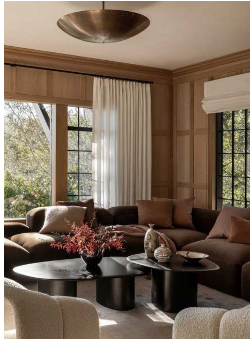
LOOK & FEEL