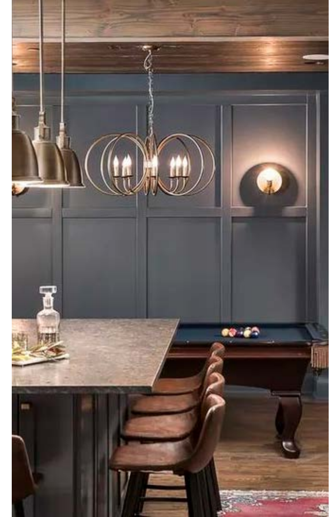
Refinish existing paneling with a rich blue tone, update current ceiling soffits with wood veneer while introducing warm copper and rich leathers for a sophisticated billiards room.