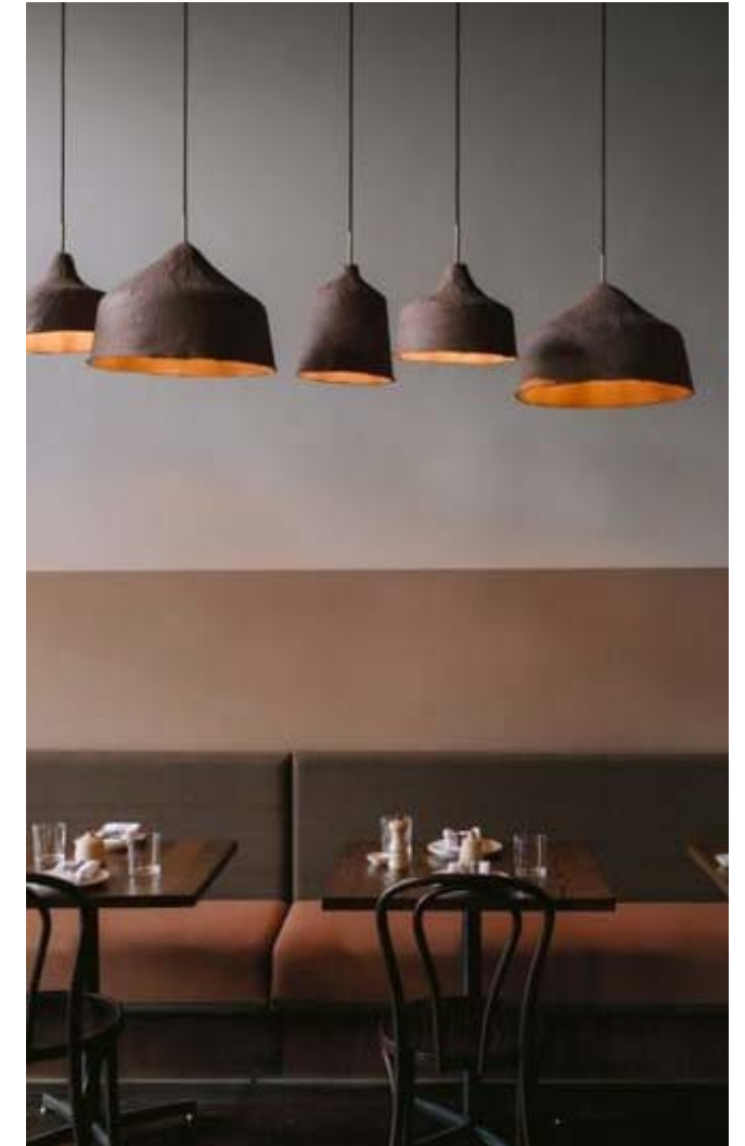
Update wall and ceiling paint with a light gray while refinishing the existing paneling with a warm terracotta creating moody lounge.