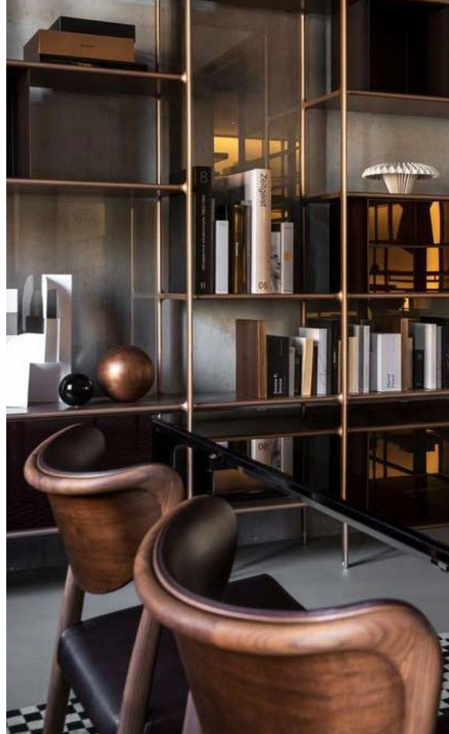
Metal panels placed at the back of existing book shelves for an unexpected reflective element.