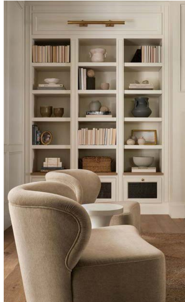
Refinish existing cabinetry in neutral tone then layer space with warm textiles and southwest inspired pottery.