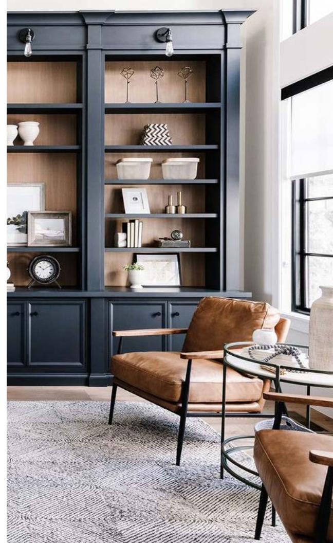
Refinish fronts of cabinetry in a soft black while preserving the natural finish on the back panels of book shelves creating interest through contrast.