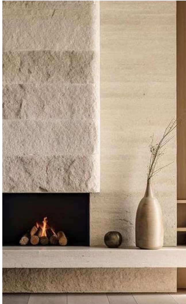
Refinish existing fireplace with textural split face limestone at center flanked by contrasting honed limestone on columns for a sophisticated statement.

fireplace . library . ballroom . billiards