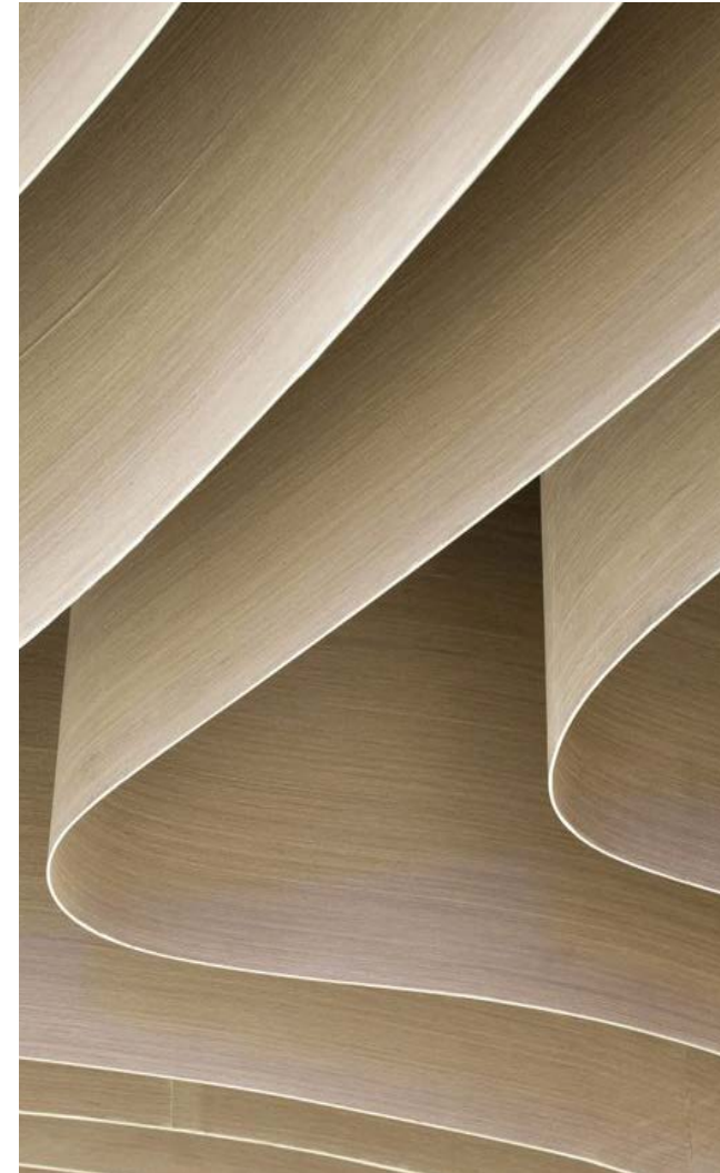
Suspend acoustic material within existing ballroom soffits in an organic pattern then illuminate to create a striking ceiling installation.