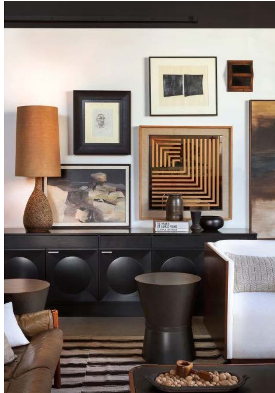
LOOK & FEEL