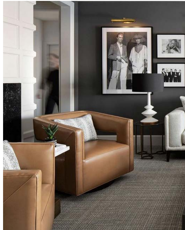
BLACK & WHITE ART

modern sophistication . graphic patterns . mixed metals . bold art