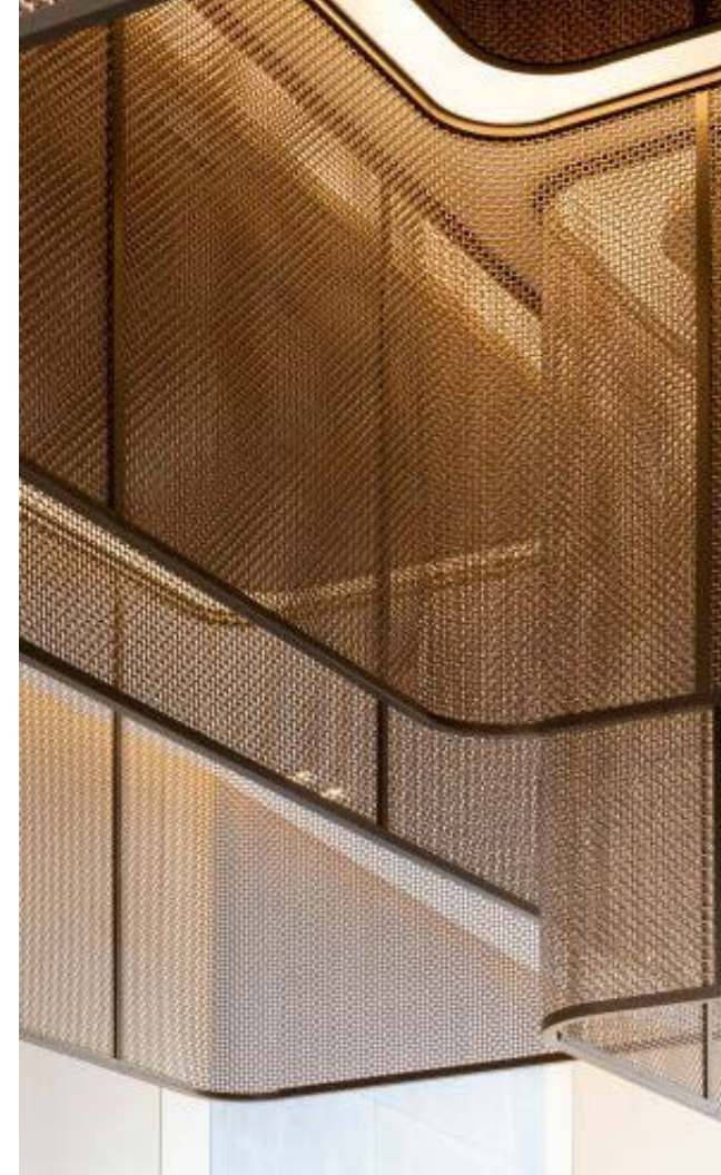
Trim existing soffits with copper mesh while replacing current ceiling tiles with reflective copper tiles illuminated with cove lighting around perimeter.