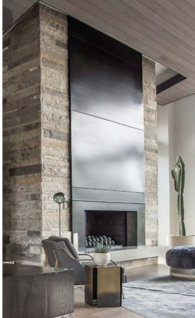
Finish vertical columns on either side of fireplace with horizontal stacked stone to connect with exterior stone while cladding central portion of fireplace with steel sheets for a modern moment upon entry.

fireplace . library . ballroom . billiards