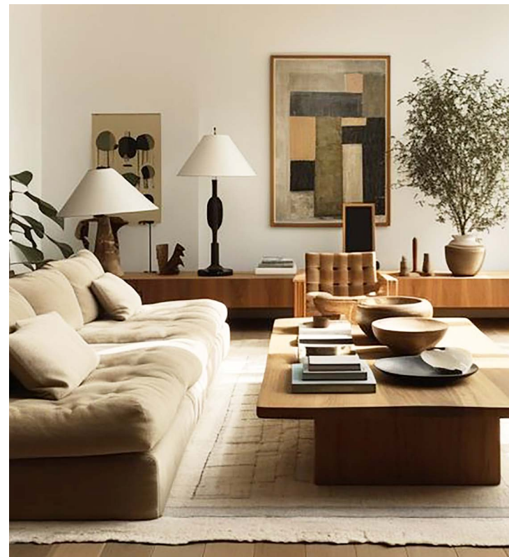
LOOK & FEEL