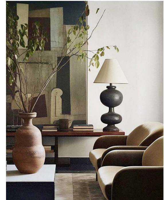
ART & ACCESSORIES