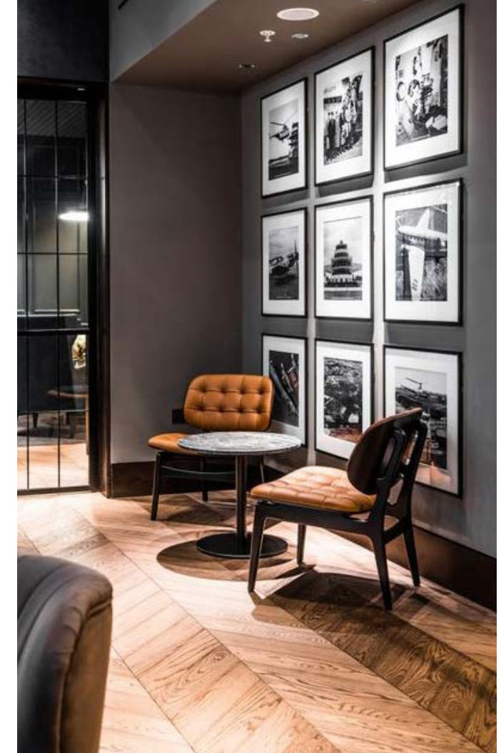
Paint existing paneling, walls and ceiling in a rich charcoal hue finished with black trim creating a bold backdrop for fun yet timeless lounge experience.