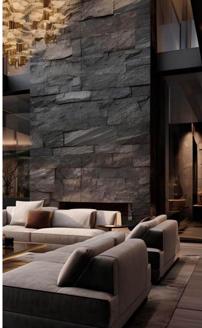
Bring central recessed portion of existing fireplace flush with flaking vertical elements and finish with textural black stone for a massive impact at the entry.

fireplace . library . ballroom . billiards